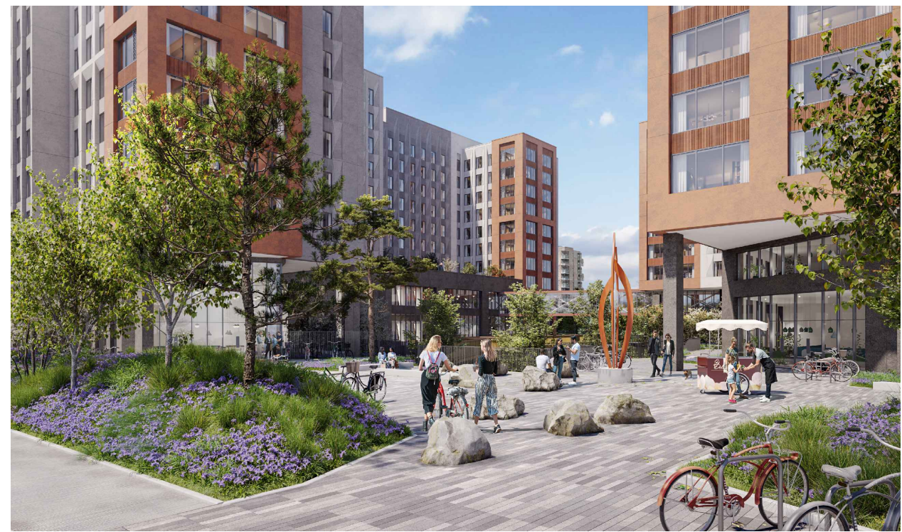
CGI Visual of the Central Plaza