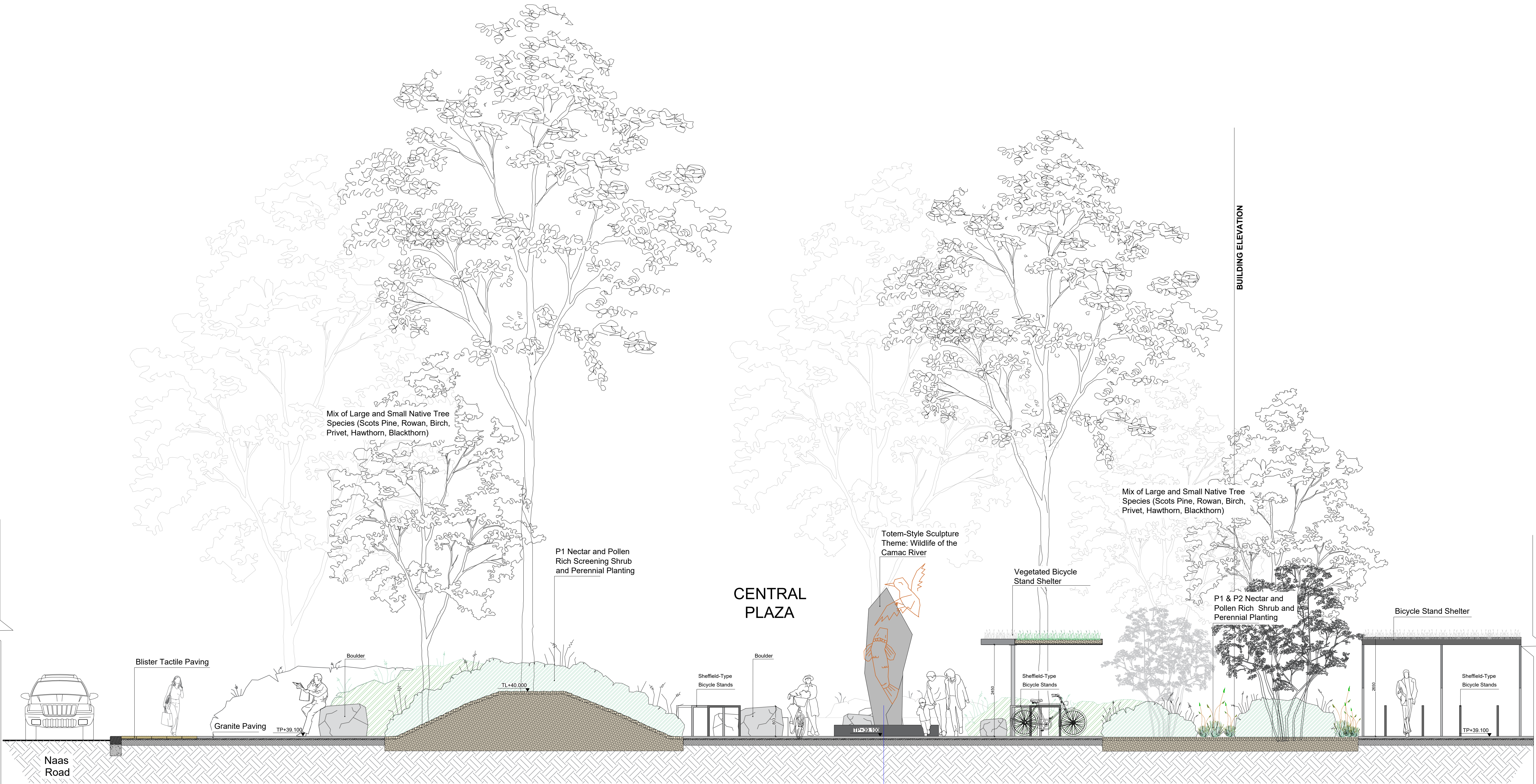
SECTION S-10 Scale 1:50