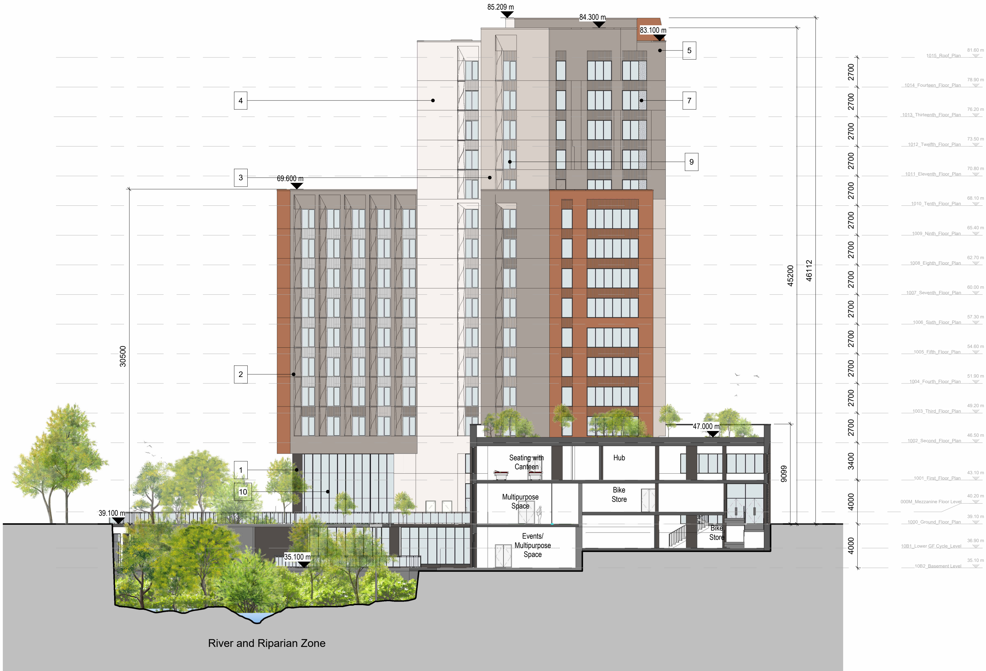
8 South Elevation 8 1 : 200