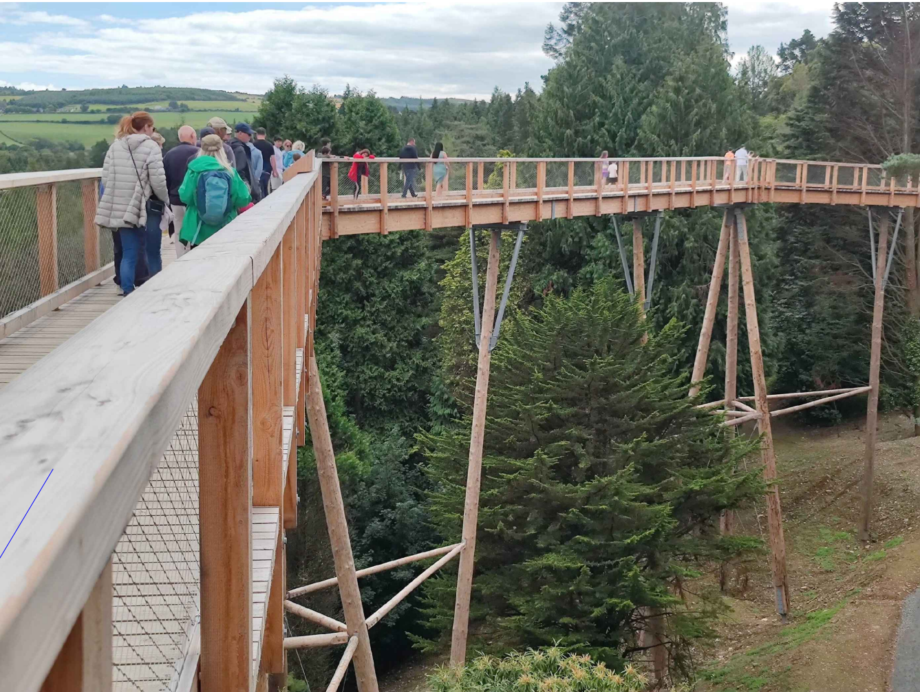
PRECEDENT IMAGE - ELEVATED WALKWAYS IN AVONDALE FOREST, CO. WICKLOW