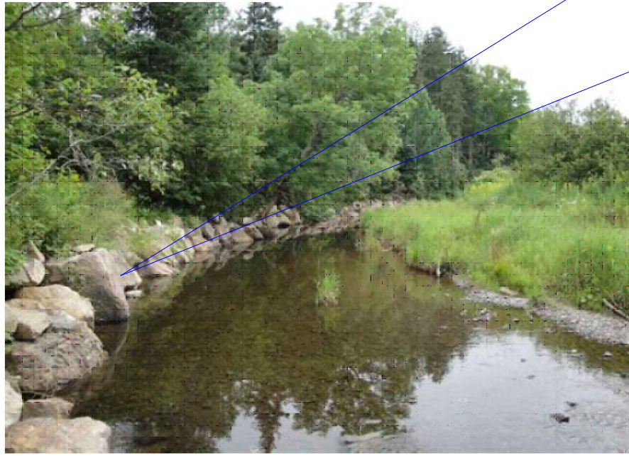
RIP-RAP Banks with Vegetation